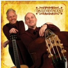
DAILEY & VINCENT

JANUARY 16, 17 & 18, 2009 Continuous Performances On TWO Stages!