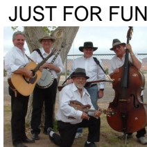
JUST FOR FUN